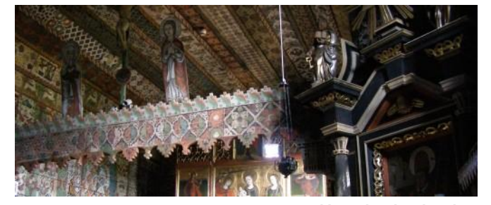
old wooden church, Dębno